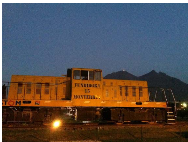
One of two saved engines with the iconic Monterrey Mountains in the background, at dusk.