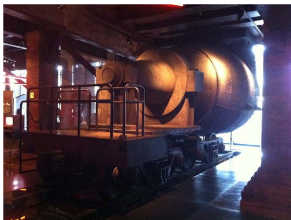
One of the transfer cars (note: it is only “half” a car)