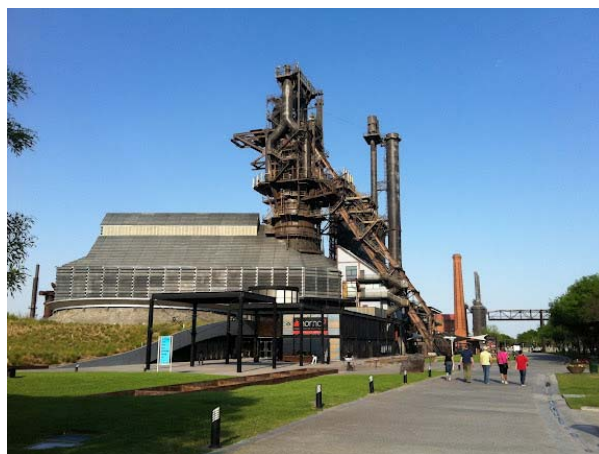
The Fundidora Steel Mill