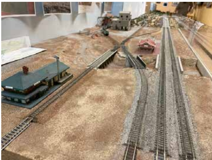
New Mexico RailRunNer's Layout - Desert scene still under construction