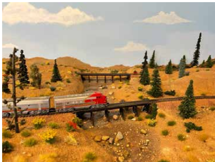
Doug Gary's home layout. Featuring Belen to Barstow. Small stream.