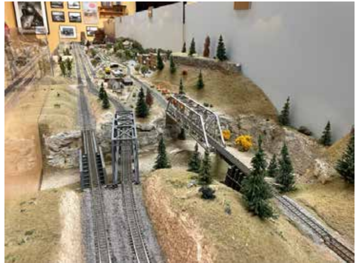
New Mexico RailRunNer's Layout - Canyon module