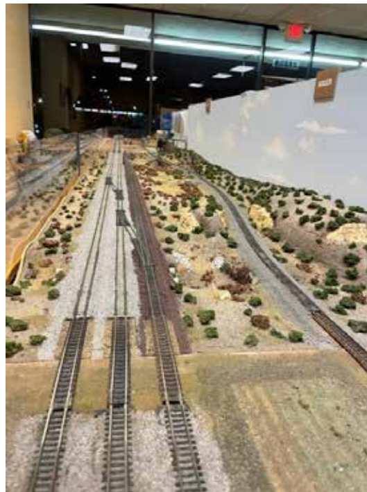
New Mexico RailRunNer's Layout - Northern New Mexico prairie lands