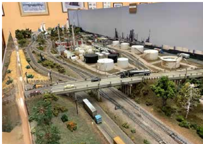
New Mexico RailRunNer's Layout - McPherson, KS. Built by Buzz Lenander