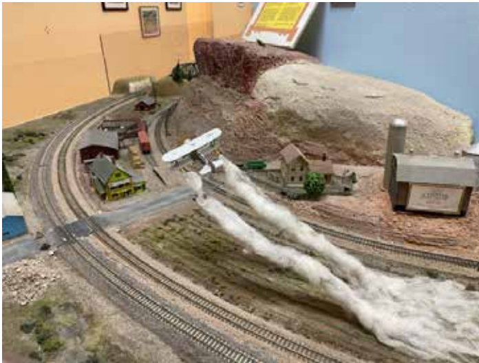
New Mexico RailRunNer's Layout - Milagro, NM