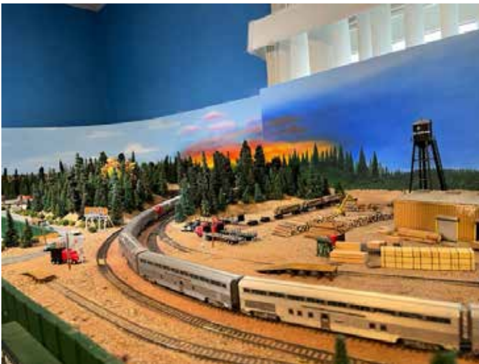
Doug Gary's home layout. Featuring Belen to Barstow. Colorado River bridge, scratch built and a perfect match of the prototype. Built by Buzz Lenander.