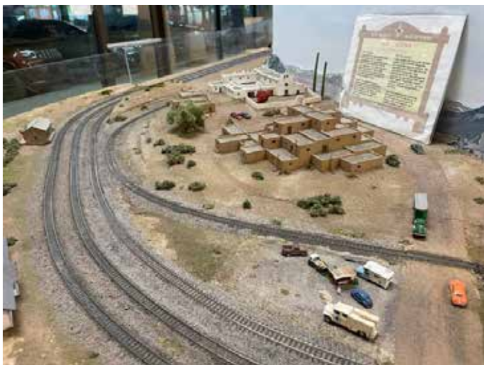
New Mexico RailRunNer's Layout - Laguna Pueblo