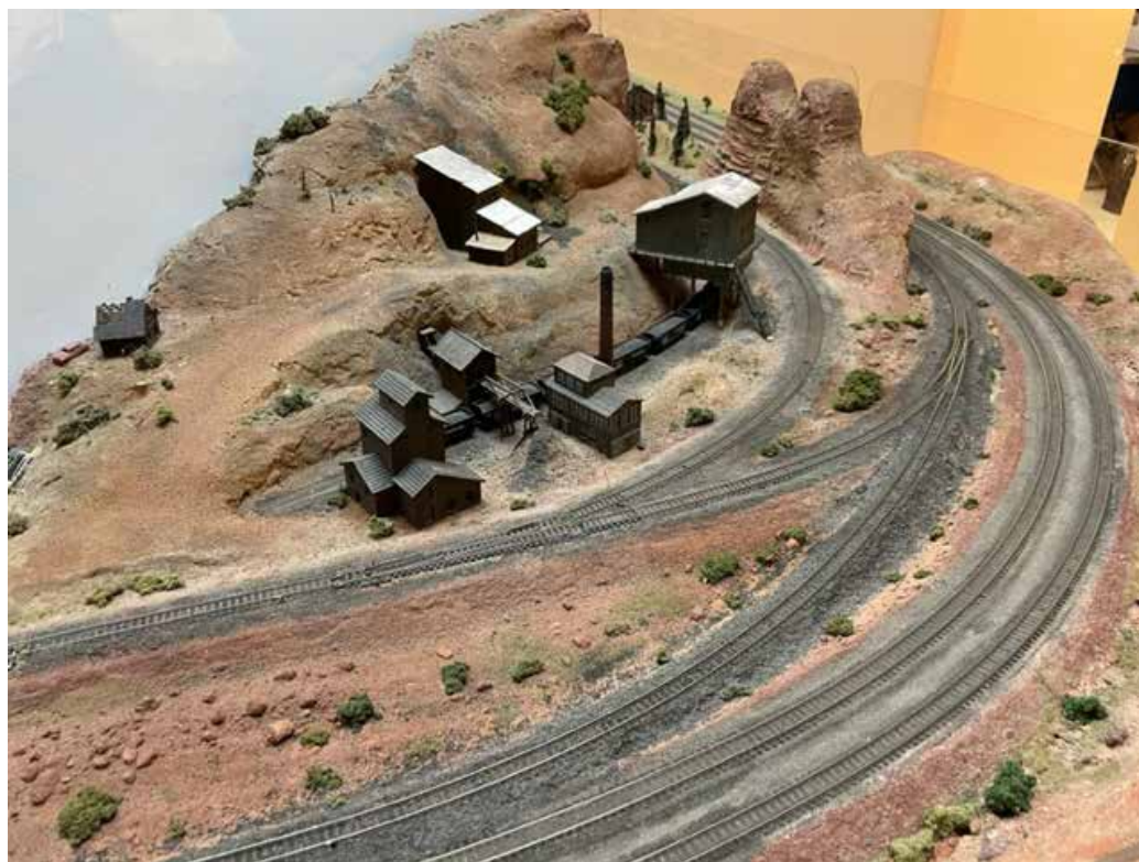
New Mexico RailRunNer's Layout - Old Mine