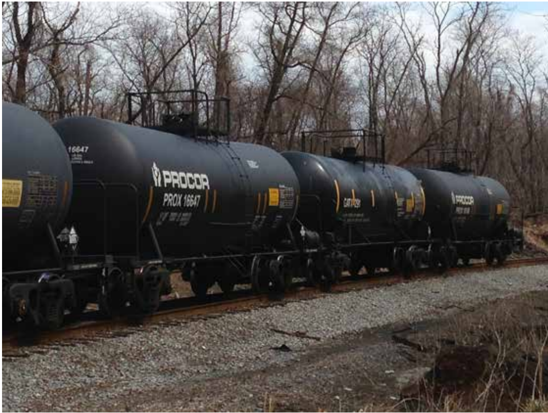
Curtis Bay, MD

BANTRAK was founded in 1983 as the Greater Baltimore N-Scale Associates. Begun as a “round robin” group to share skills and experiences, we have expanded our focus to include participation in many diverse activities to promote model railroading in general and N-Scale model railroading in particular. Activities include participation in local, regional and national shows, meets and conventions. BANTRAK membership includes membership in the national NTRAK organization.