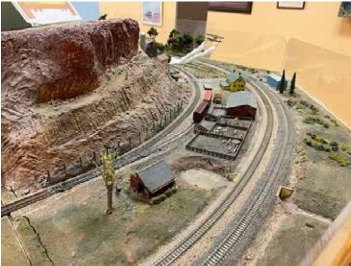
New Mexico RailRunNer's Layout - Milagro, NM