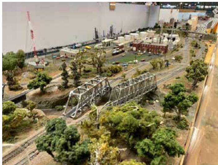
New Mexico RailRunNer's Layout - McPherson, KS. Built by Buzz Lenander